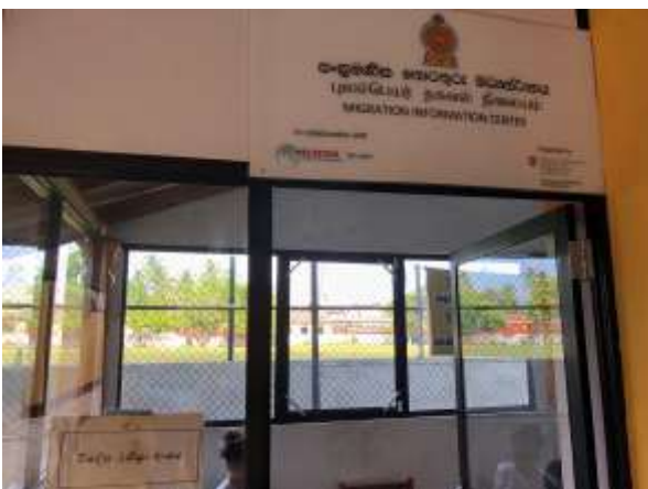
Migration Information Center in Hikkaduwa Divisional Secretariat

When the Development Officers Foreign Migration (DO FEs) were recruited in 2012, many of the Divisional Secretariats were not able to provide them with the space and equipment necessary for their work. As the years of 2012 and 2013 were also peak years for female labour migration (SLBFE), many of these DO FEs were not familiar with how to provide quality services to Migrant Workers (MWs) and their families and many were overwhelmed with the magnitude and gravity of the issues they were confronted with. These concerns were also raised by Civil Society organisations, working with MWs. One of the biggest challenges for DO FEs to adequately respond to were family related problems, which arose due to the absence of the mother or the father. Distraught family members would storm into the Divisional Secretariat, yet the DO FEs were unable to receive them in an appropriate set-up and provide them with the necessary services, since they were lacking a private space to listen and talk to those who sought help. At the same time, labour recruitment agencies, were regularly visiting and submitting complaints to the DO FEs. In the framework of the Labour Migration Project Sri Lanka, the Swiss Agency for Development and Cooperation (SDC) therefore funded the establishment of 3 Migration Information