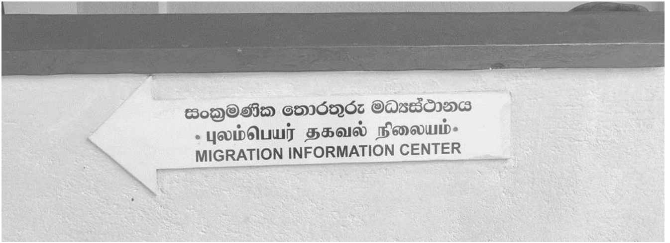
Migration Information Center in Hikkaduwa Divisional Secretariat.