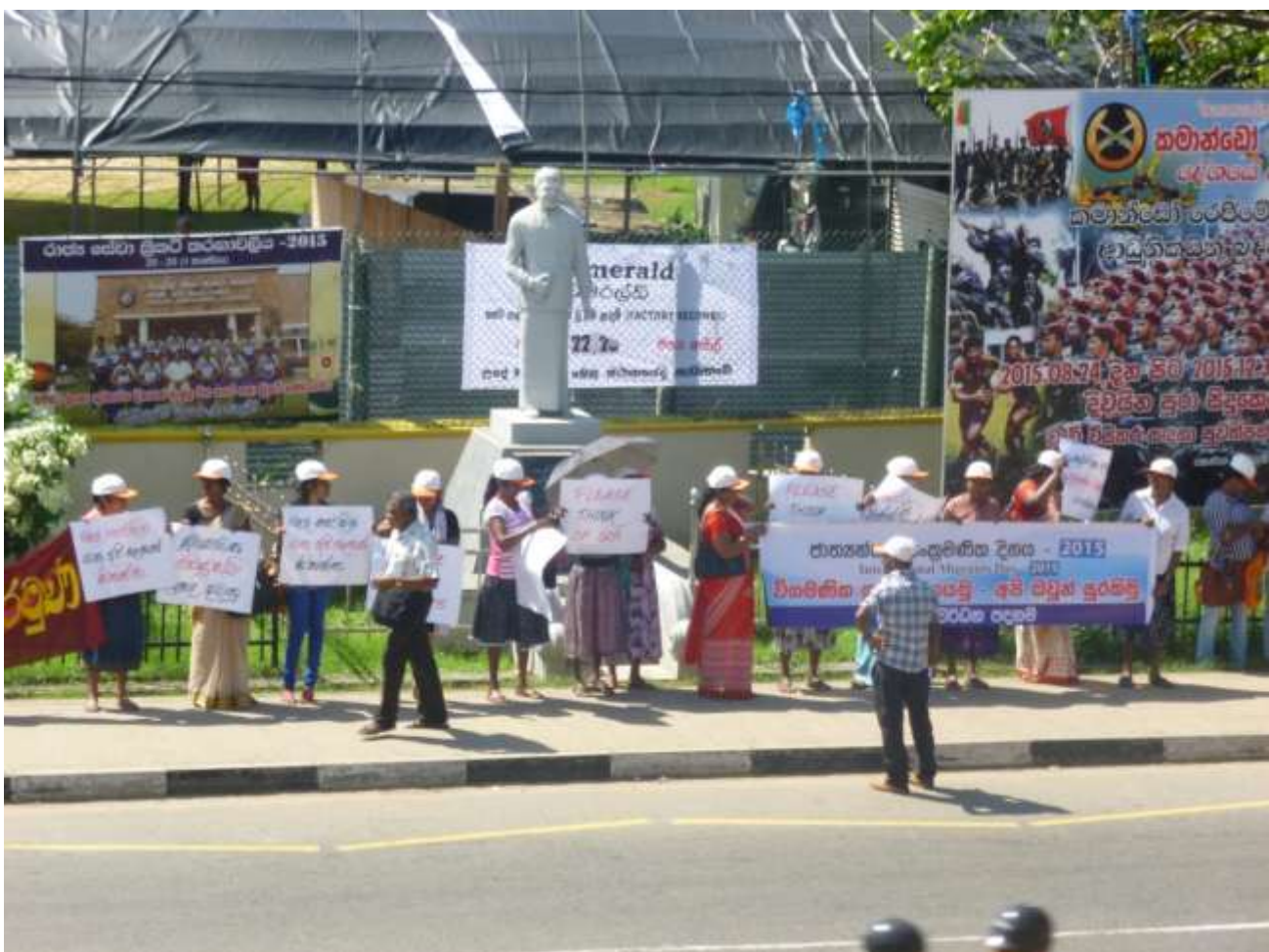
Migrant workers' day in Galle.

The package matters: Providing DO FEs with separate rooms and infrastructure without giving them the skills and knowledge on delivering their services to MWs, is not going to be successful. Only the combination of skills and the necessary infrastructure, is making the model a success.