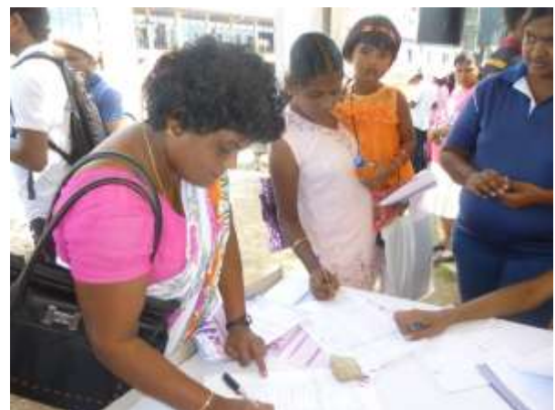
DOFEs at work.

Limited space within the MIC premises appears to be an issue common in all districts MICs, which cater to hundreds of migrant workers and their families every month. Certain MICs lack space for storage of equipment and documents, while a considerable number of MICs lack space to conduct safe labour migration related awareness programmes for migrant workers and their families inside the MIC. Some MICs, complained of having the